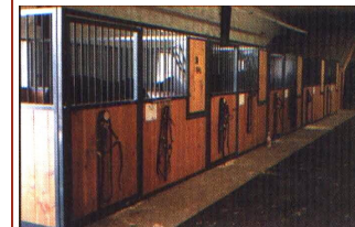
Modular Horse Stalls