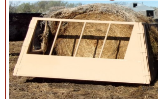
Modular Bale Feeder

Stock Cents Manufacturing Fairfax, SD 605-654-2001 Made proudly in the USA