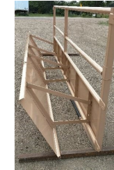
Bottomless Fence Line Feed Bunk & Panel